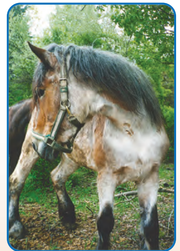
Pictured: Uncle Milt