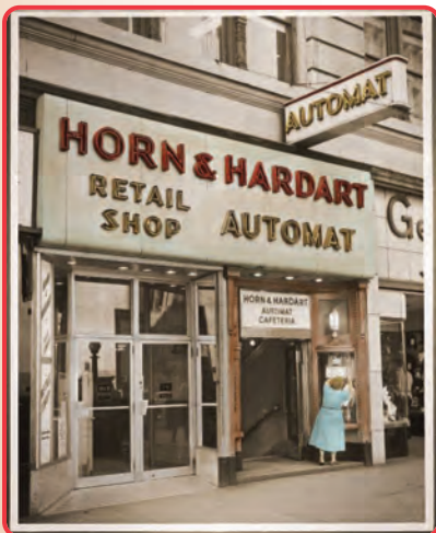
Horn & Hardart Retail Shop

Heath Village Voice Heath Village Hackettstown, NJ 908-852-4801